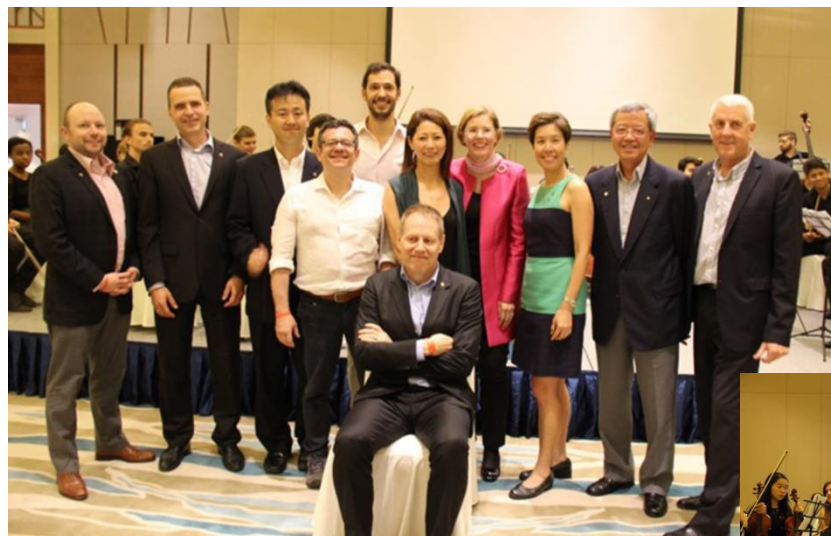
President and new Board