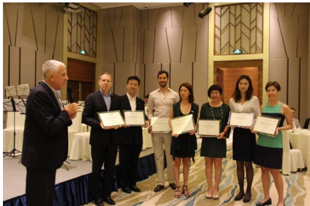
Commending key contributors from the last year